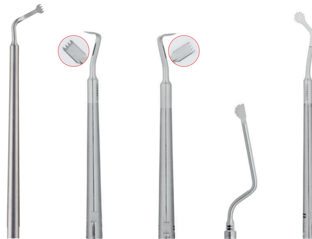
BS1 XXL RHL4L** RHL4R** RHL5** RHL6**