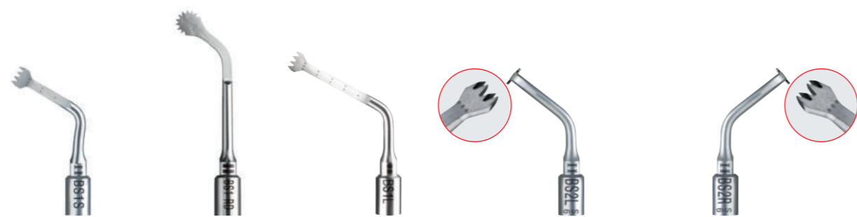
BS1S BS1RD BS1L BS2L BS2R