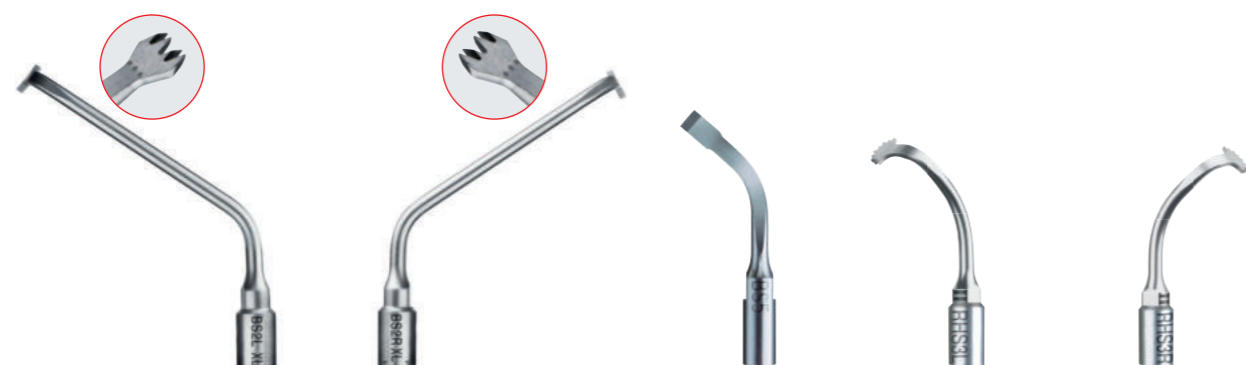
BS2L XL BS2R XL BS5 RHS3L RHS3R