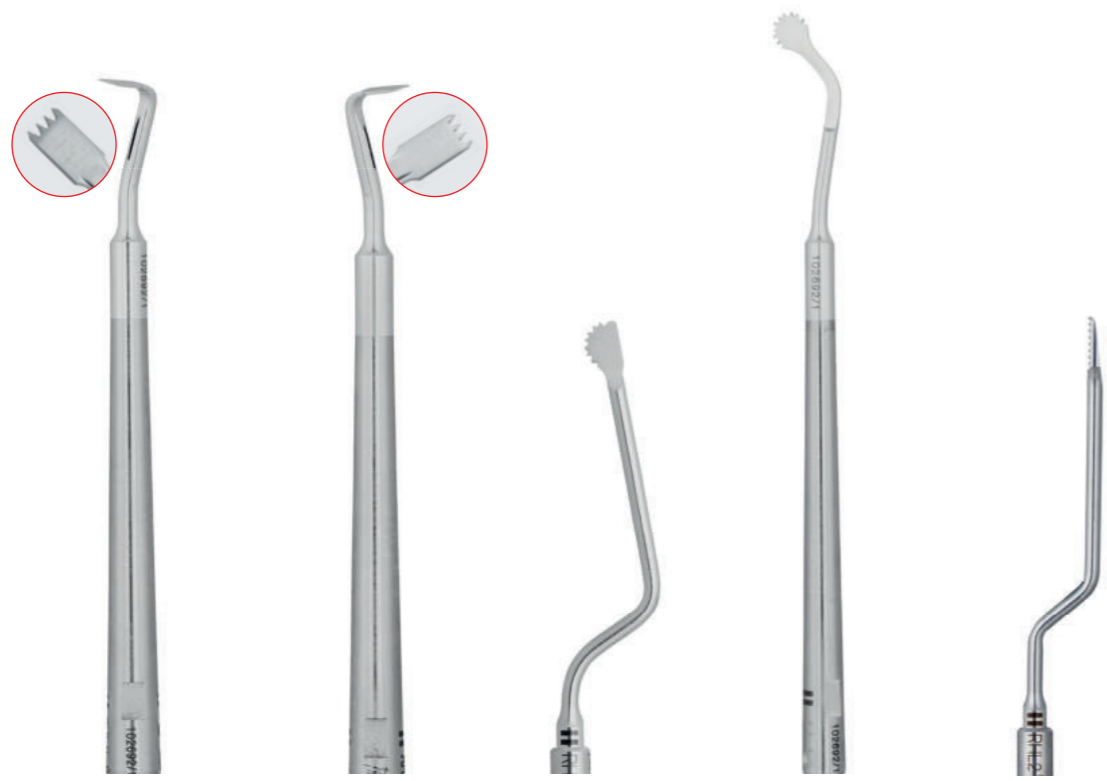
RHL4L** RHL4R** RHL5** RHL6** RHL2**