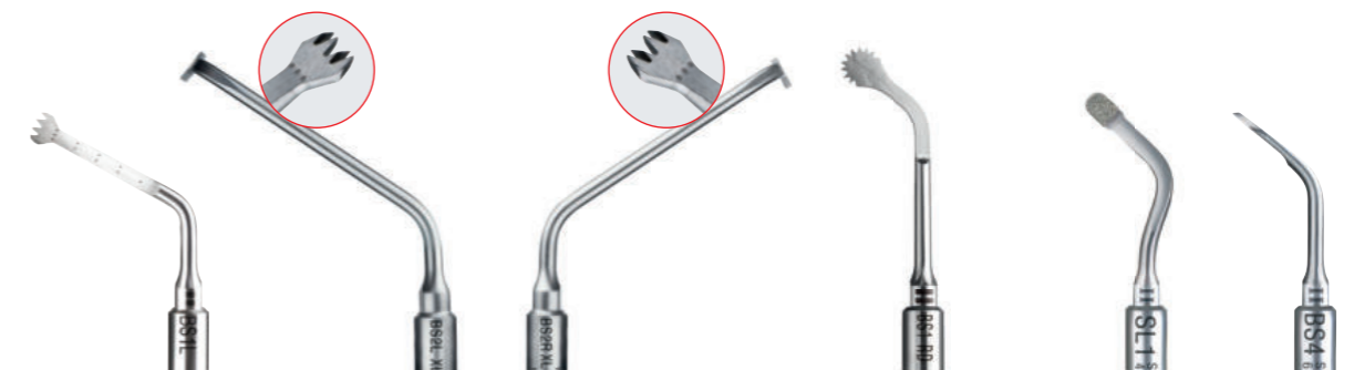
BS1L BS2L XL BS2R XL BS1RD SL1 BS4