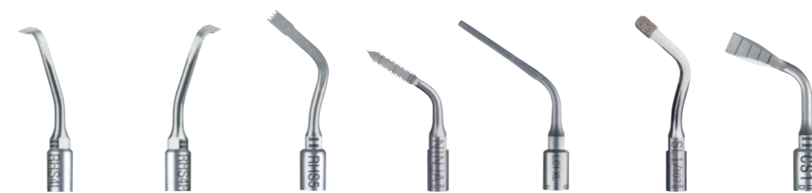
RHS4L RHS4R RHS5 NINJA LC1 XL SL1 CS1