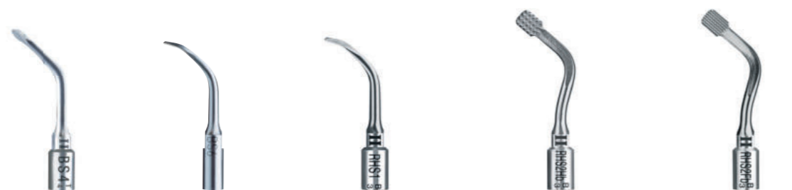
BS4 BS6 RHS1 RHS2Hb RHS2Fb