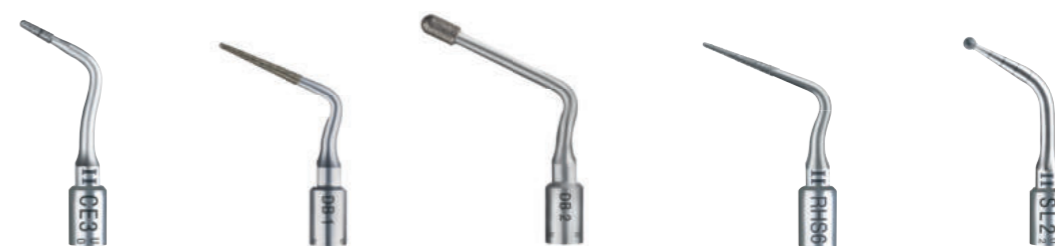
CE3 DB1 DB2 RHS6 SL2